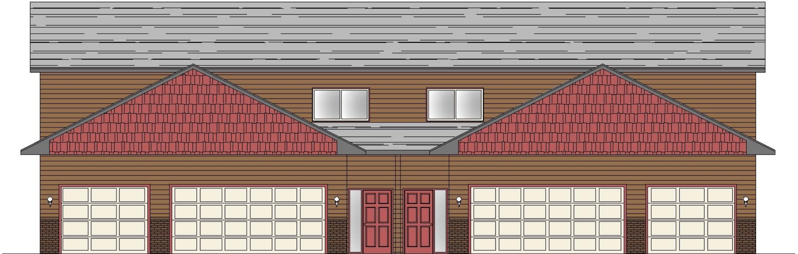
2-Story Loft Twin Home with 3-Stall Garage